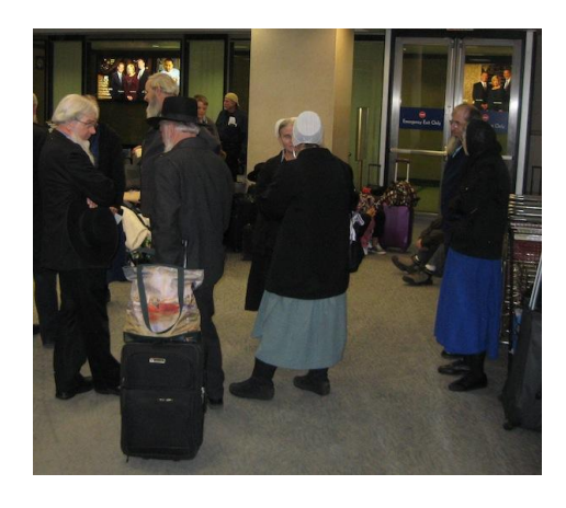
A Visit to the 19<sup>th</sup> Century

That makes a bond short a core position in any balanced portfolio. Don't get lazy. Make sure you only sell a rally lest we get trapped in a range, as we did for most of 2021.