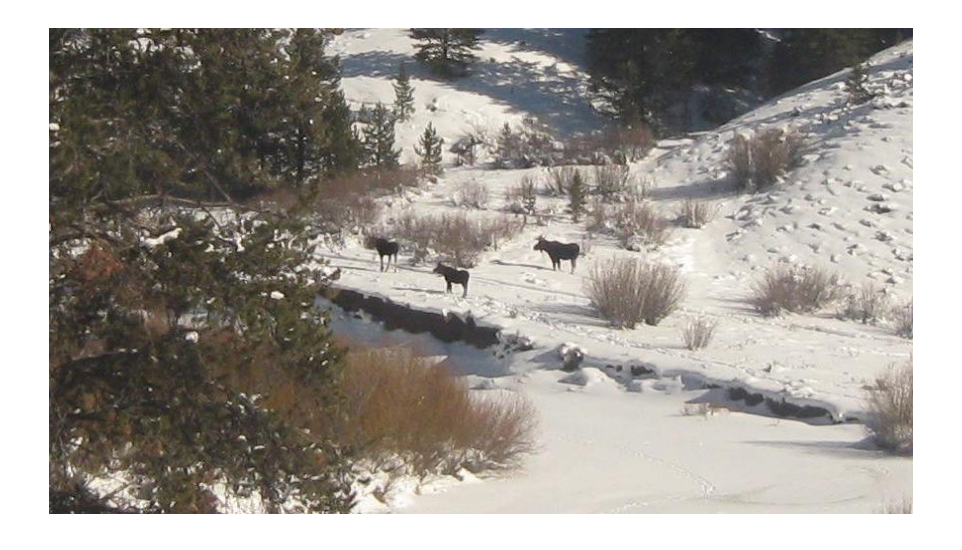
A Rocky Mountain Moose Family

This sets up a Goldilocks economy that could go on for years: high growth, low inflation, and full employment. Help wanted signs will slowly start to disappear. A 3% handle on Headline Unemployment is withing easy reach.