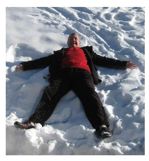
Snow Angel on the Continental Divide