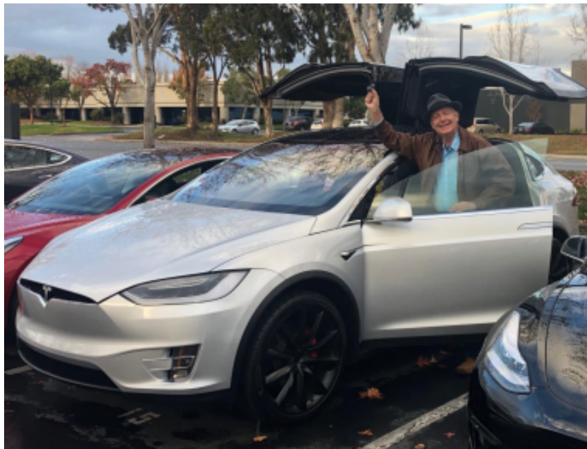
My Latest Set of Wheels