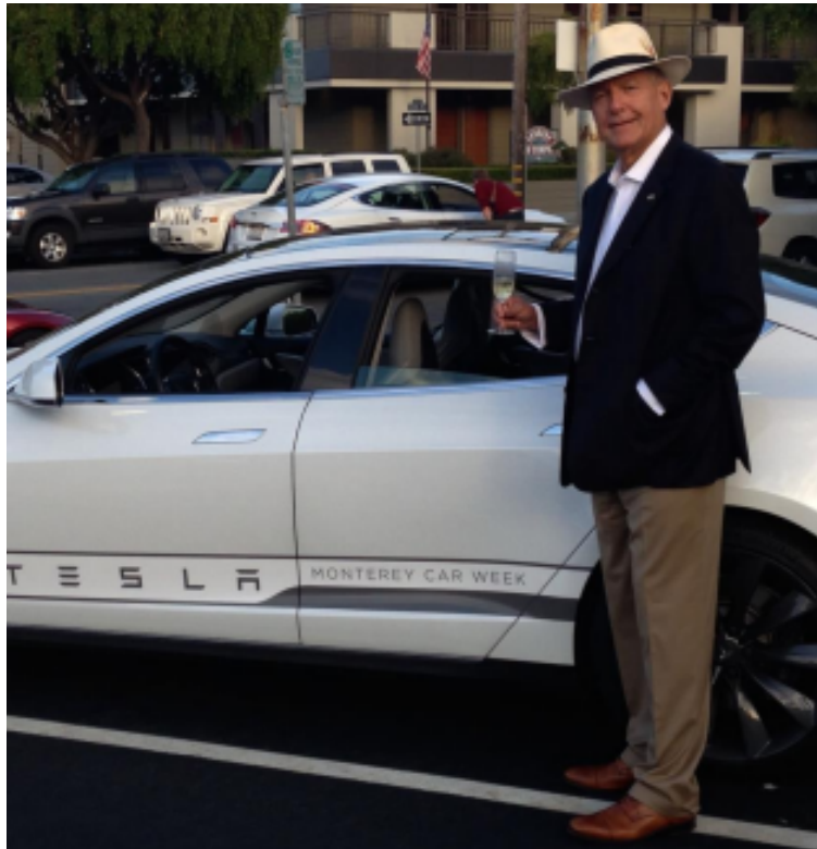
At the Pebble Beach Car Show with Elon