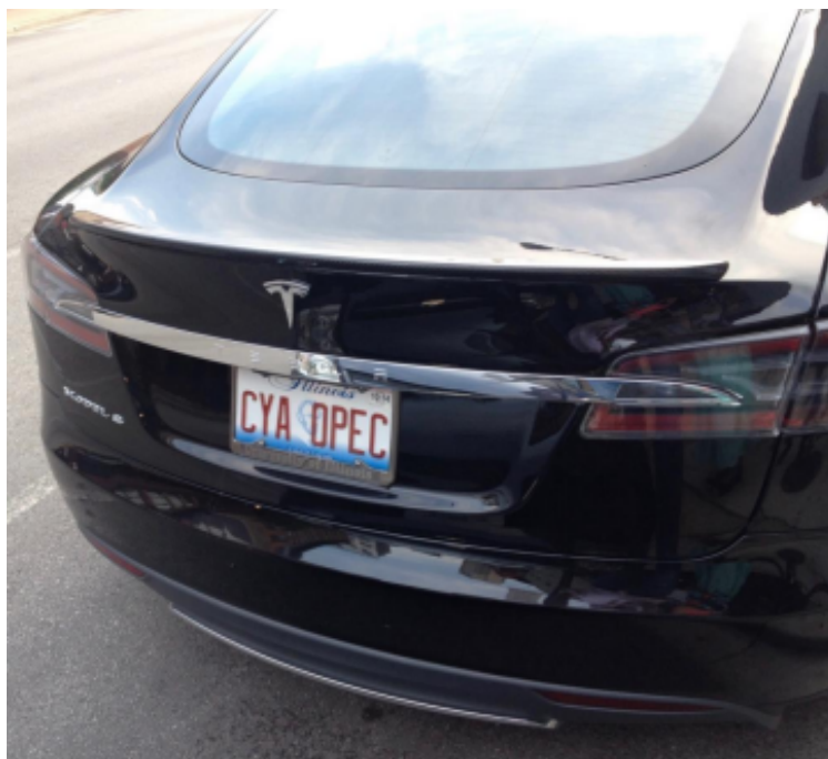
Like Minded Found in Chicago