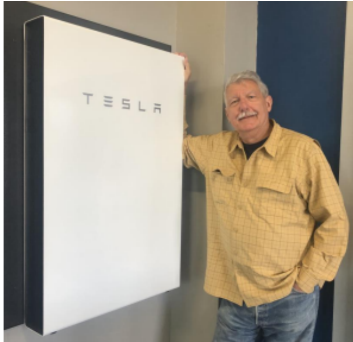
13.5 kWh Powerwall, Enough Juice to Run My House for a Day and I have Six of These