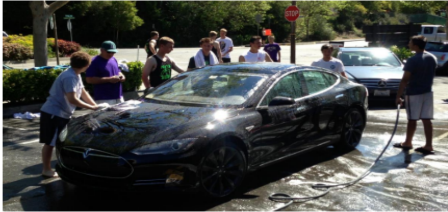
Back in 2010, The First Tesla They Had Ever Seen