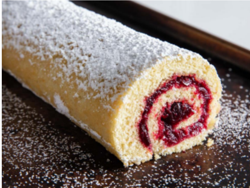
What its Modeled After