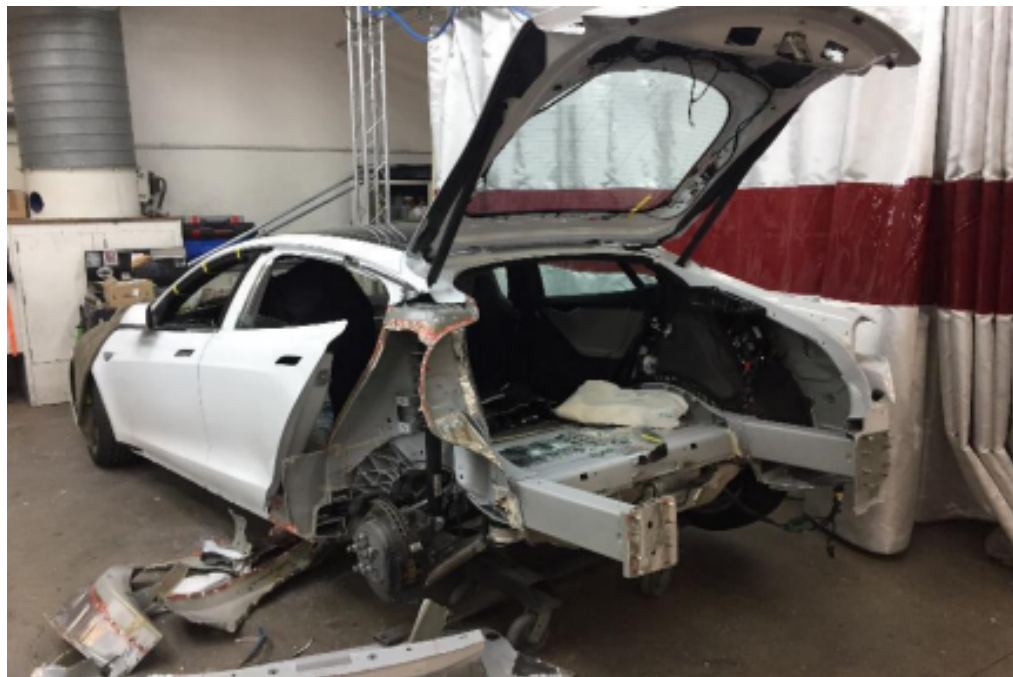
Chassis No. 125....R.I.P.