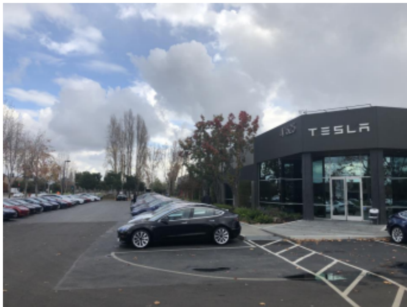
This Lot of 300 Cars in Fremont Gets Filled and Emptied Out Three Times a Day